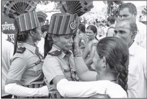
A newly-inducted police constable with her family members during the passing out parade, in Nagpur on Friday.